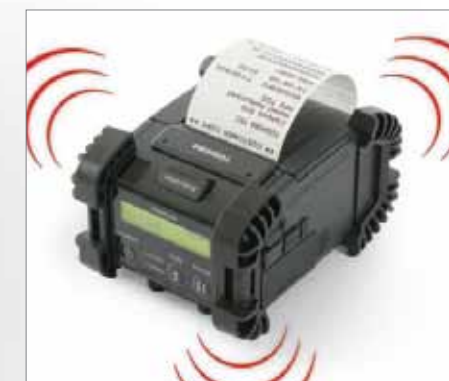
Wi-Fi certified (GH40 model)