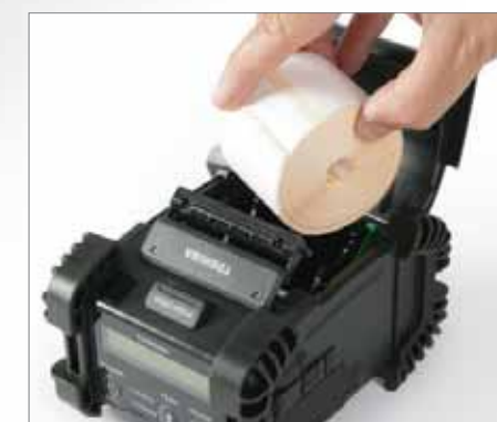
Market-leading media capacity for fewer roll changes