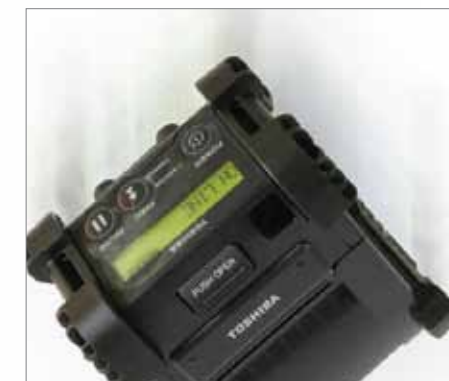
Robust and rugged, withstands a 1.8m drop on to concrete (1.5m for B-EP4)